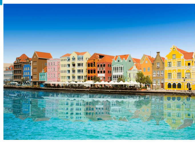
Snorkeling & beautiful beaches at all these locations too!

Look how picturesque the town is in C uracao. So, colorful and beautiful.